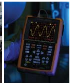
Figure 2. Night vision viewing mode