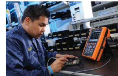
Figure 1. Indoor viewing mode